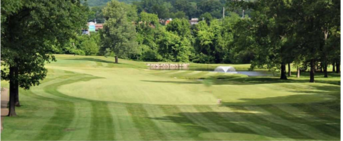
The Legends Country Club in Eureka, Mo.