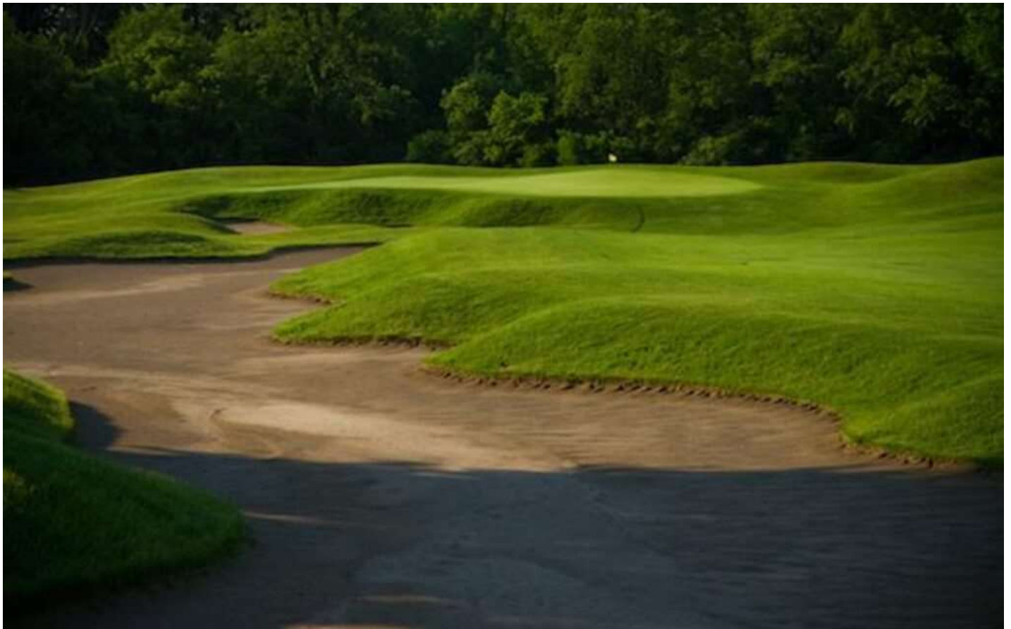
The Golden Fox Golf Course at Fox Hills Golf & Banquet Center in Plymouth, Mich.

Fox Hills Golf & Banquet Center, located in Plymouth, Mich., and The Legends Country Club, located in Eureka, Mo., are the 22nd and 23rd properties in Heritage's portfolio of private country clubs and high-end daily fee golf courses. Fox Hills is the first club that Heritage owns in the Michigan market, while Legends is the second club owned by Heritage in the St. Louis suburban market.